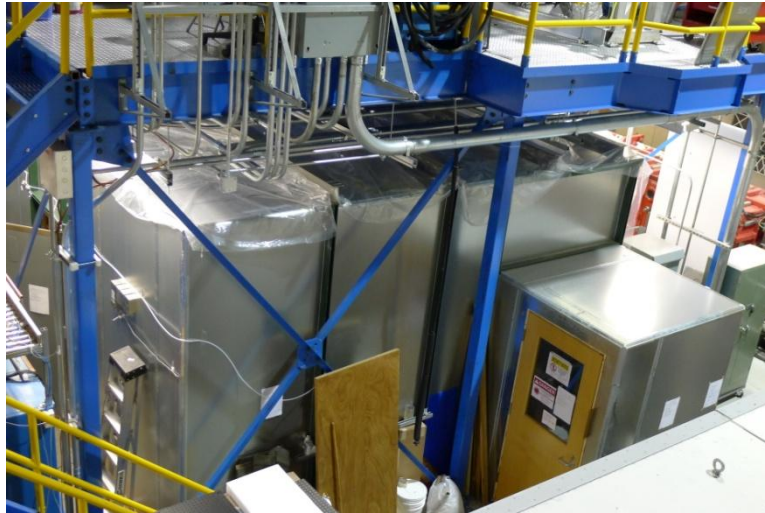
Fig. 1. Shielded room housing the FrPNC experiment in the ISAC hall. The metallic room is located below the blue platform.

francium atoms will be smaller, but since they remain trapped, the number of atoms in the interaction region at any given time is similar to the experiments with Cs [13].